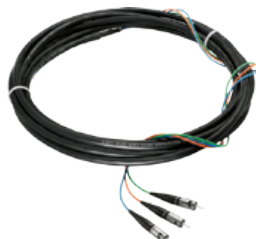
Standard Fiber Connectors