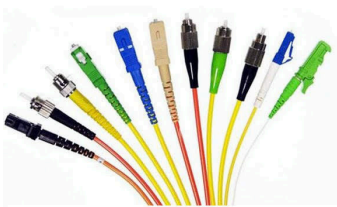
Standard Fiber Connectors

ST, SC, LC, FC and other industry standard fiber connectors are available with any type of fiber and cable. Our attention to quality for single mode, multimode, simplex, duplex and any combination of these ensures a successful connection every time. Cable assemblies are available in low volume quick turn or high volume low cost from our local and international factories.