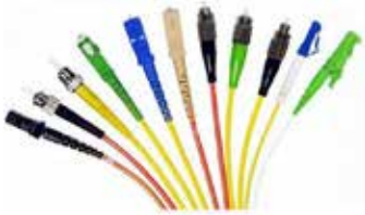
Standard Fiber Connectors

ST, SC, LC, FC and other industry standard fiber connectors are available with any type of fiber and cable. Our attention to quality for single mode, multimode, simplex, duplex and any combination of these ensures a successful connection every time. Cable assemblies are available in low volume quick turn or high volume low cost from our local and international factories.