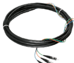
Standard Fiber Connectors